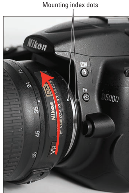
Figure 1-1: When attaching the lens, align the index markers as shown here.

Check your lens manual to find out whether your lens sports an aperture ring and how to adjust it. (The D5000 kit lens doesn't.) To find out more about apertures and f-stops, see Chapter 5.