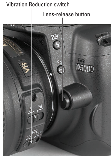
Figure 1-2: Press the lens-release button to disengage the lens from the mount.

However, when you use a tripod, vibration reduction can have detrimental effects because the system may try to adjust for movement that isn't actually occurring. That's why your kit lens — and all Nikon VR lenses — have an On/Off switch, which is located on the side of the lens, as shown in Figure 1-2. Whether you should turn off the VR feature, though, depends on the specific lens, so check the manual. For the 18–55mm kit lens, Nikon does recommend setting the switch to the Off position for tripod shooting, assuming that the tripod is “locked down” so the camera is immovable.