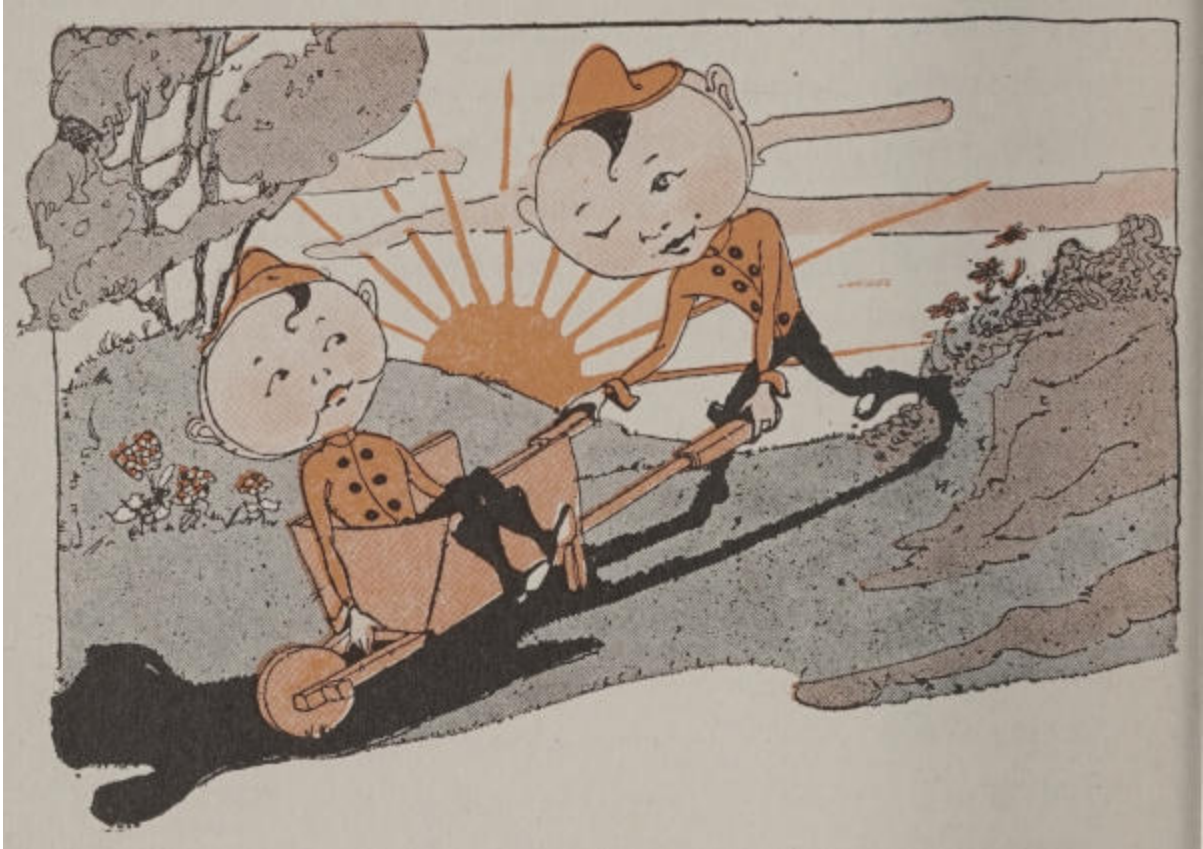
He Wheeled Him in a Wheelbarrow