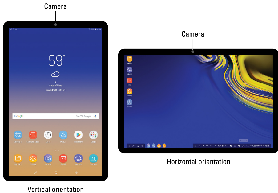
FIGURE 1-1: Galaxy Tab orientations.

As far as the touchscreen goes, the image orients itself properly no matter how you hold the tablet. For reference purposes, however, the front-facing camera identifies the top of the device, as illustrated in Figure 1-1.