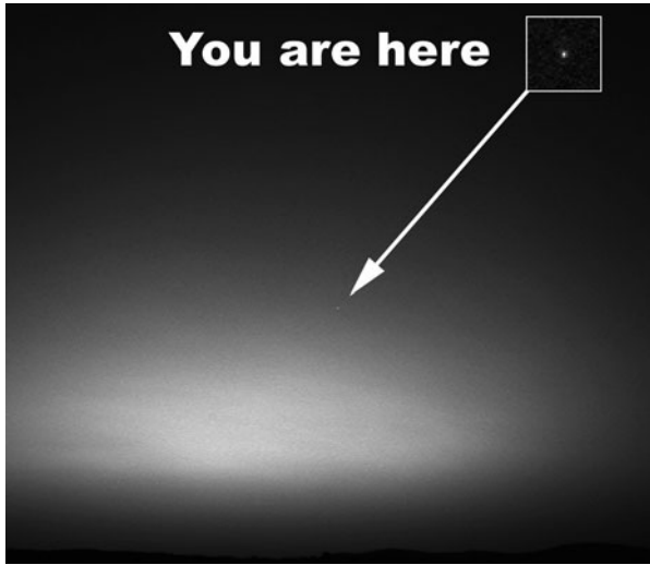
Fig. 1.1 The first image of Earth taken from the surface of another planet: this photograph was taken in March 2004 by the Mars Exploration Rover Spirit. Earth is just about visible on a computer screen; the limits of printing technology mean you might not be able to see it here. Earlier, in 1990, Voyager 1 sent back a photograph of Earth taken from much further away—a distance of about 6 billion kilometers. In Carl Sagan’s words, Earth appeared as a pale blue dot. When contemplating the insignificance of the piece of rock we inhabit, and the billions of similar rocks that must be out there, it’s difficult to believe we might be alone in the universe.

Rendezvous with Rama —all these were part of my mental furniture. And yet where were these marvels? The imaginations of SF writers had shown me hundreds of possible universes, but my astronomy lecturers had made it clear that so far, whenever we look out into the real universe, we can explain everything we see in terms of the cold equations of physics. Put simply, the universe looks dead. The Fermi question: where is everybody? The more I thought about it, the more the paradox seemed to be significant.