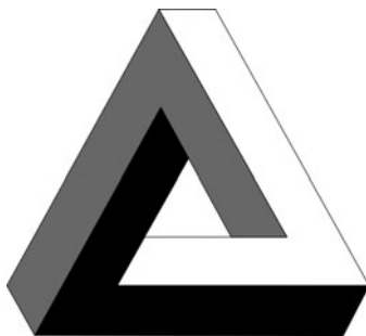
Fig. 2.2 A visual paradox. This impossible figure is a Penrose triangle. It's named after Roger Penrose, a British mathematician who devised it in the 1950s. (It was first created even earlier, in 1934, by the Swedish graphic artist Oscar Reutersvärd.) The illustration appears to show a three-dimensional triangular solid, but the triangle is impossible to construct. Each vertex of a Penrose triangle is in fact a perspective view of a right angle. Artists such as Escher and Reutersvärd delighted in presenting visual paradoxes.

A weak paradox or fallacy can often be clarified with a little thought. The contradiction usually arises because of a mistake in a chain of logic leading from premises to conclusion. For example, beginning students of algebra often construct “proofs” of obviously untrue statements such as 1 + 1 = 1 . Such “proofs” usually contain a step in which an equation is divided by zero. This is the source of the fallacy, since dividing by zero is inadmissible in arithmetic: if you divide by zero you can “prove” anything at all. In a strong paradox, however, the source of a contradiction is not immediately apparent; centuries can pass before matters are resolved. A strong paradox has the power to challenge our most cherished theories and beliefs. Indeed, as the mathematician Anatol Rapoport once remarked: 8 “Paradoxes have played a dramatic part in intellectual history, often foreshadowing revolutionary developments in science, mathematics and logic. Whenever, in any discipline, we discover a problem that cannot be solved within the conceptual framework that supposedly should apply, we experience shock. The shock may compel us to discard the old framework and adopt a new one.”