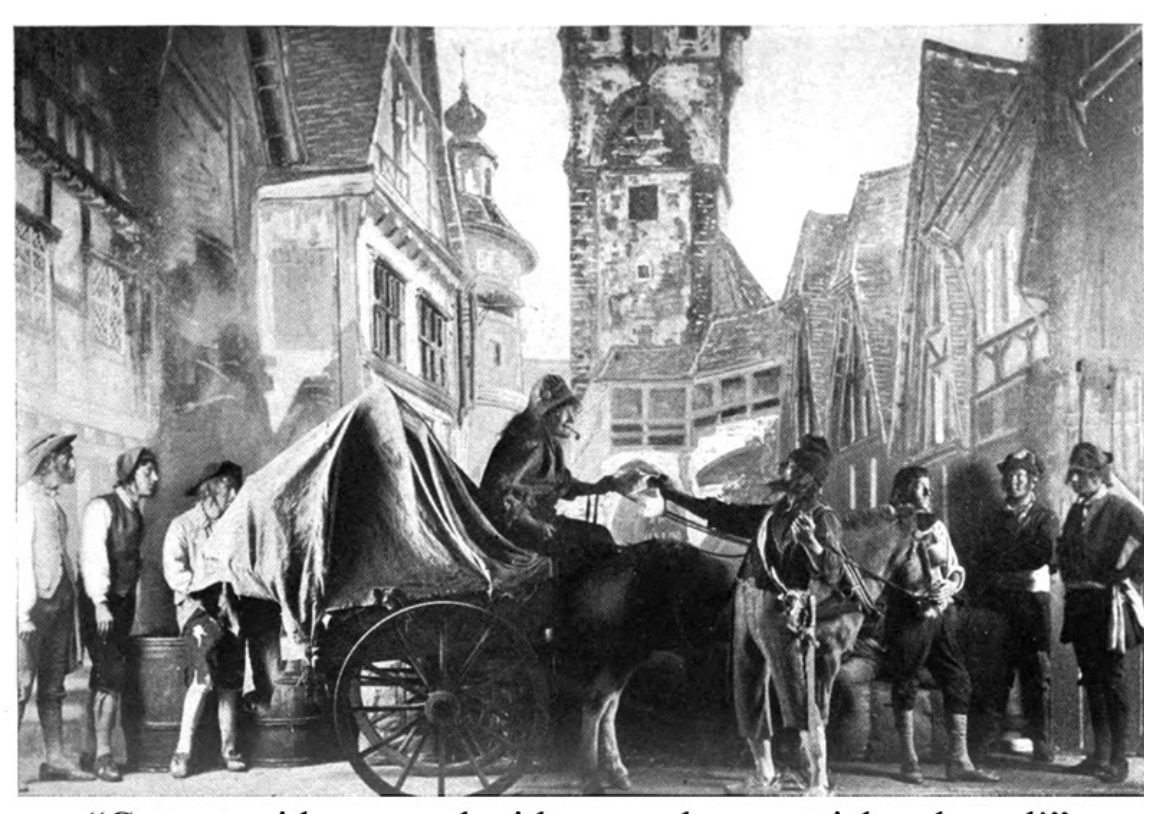
"Get out with you and with your plague-stricken brood!" shouted Bibot, hoarsely.

And with another rough laugh and coarse jest, the old hag whipped up her lean nag and drove her cart out of the gate.