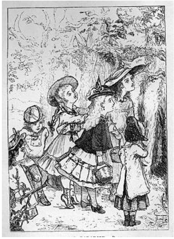
So in they marched, Katy and Cecy heading the procession, and Dorry, with his great trailing bunch of boughs, bringing up the rear.