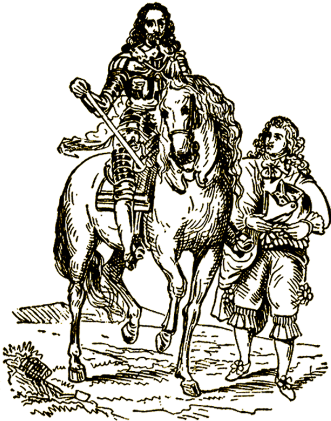
Charles I. and Armor Bearer.

Young Charles was very weak and feeble in his infancy. It was feared that he would not live many hours. The rite of baptism was immediately performed, as it was, in those days, considered essential to the salvation of a child dying