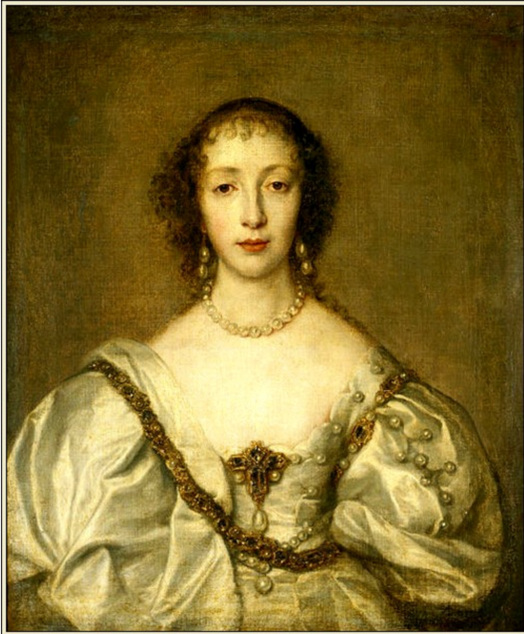
Queen Henrietta Maria.

Now inasmuch as, at the time when this prediction was uttered, there seemed to be little human probability of its fulfillment, it attracted attention; its unexpected and startling character made every one notice and remember it; and the old laird was at once an object of interest and wonder. It is probable that this desire to excite the