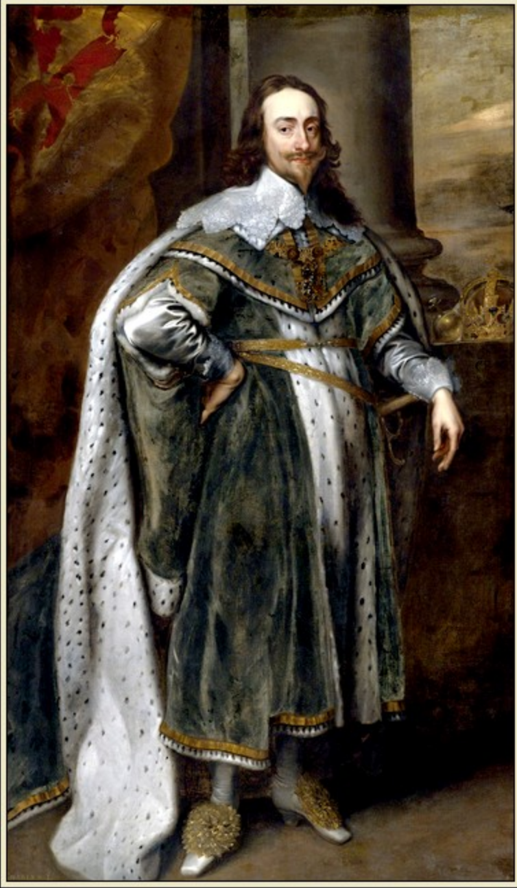
King Charles I. Portrait by van Dyck.