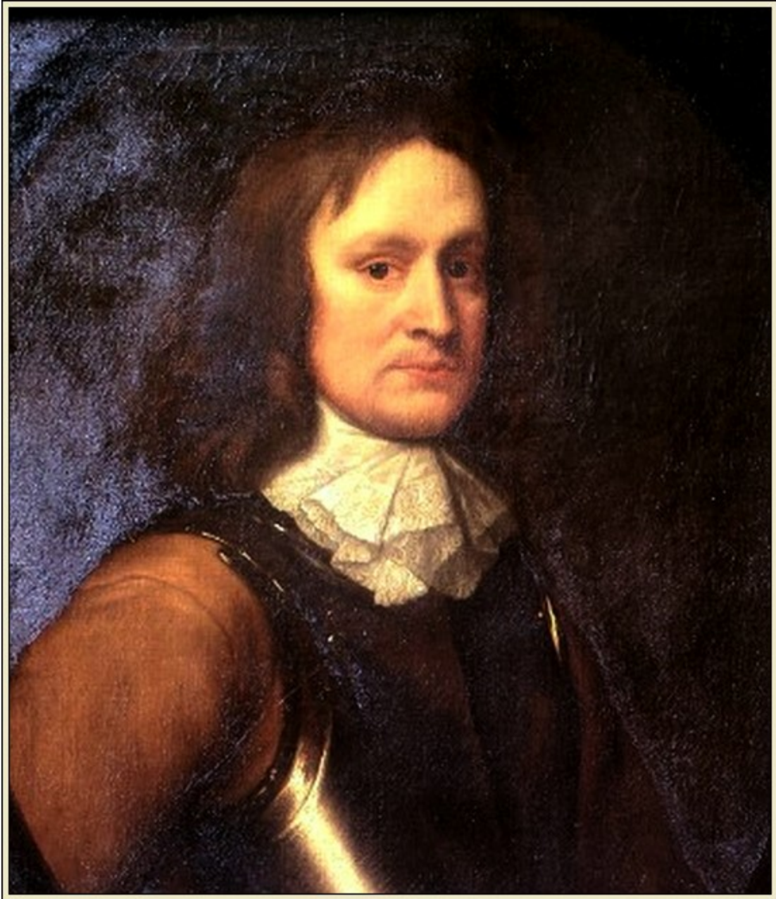
Portrait of John Hampden.

As it is very inconvenient, moreover, for a king to leave his dominions, the marriage ceremony is usually performed at the court where the bride resides, without the presence of the bridegroom, he sending an ambassador to act as his representative. This is called being married by proxy. The bride then comes to her royal husband's dominions,