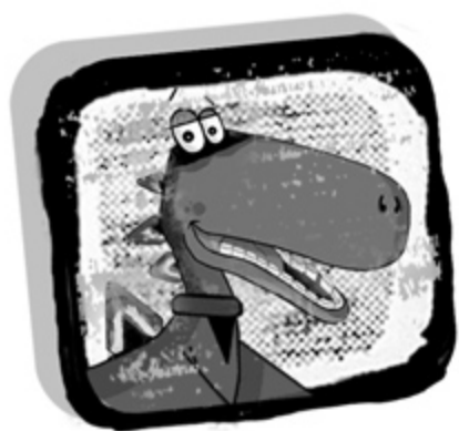
CAPTAIN TEGGS STEGOSAUR