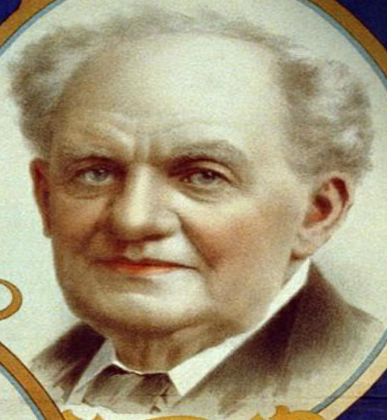
P. T. BARNUM.