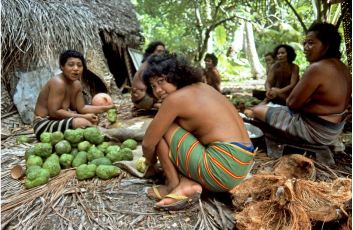
Daily life in the village on Feshailap.