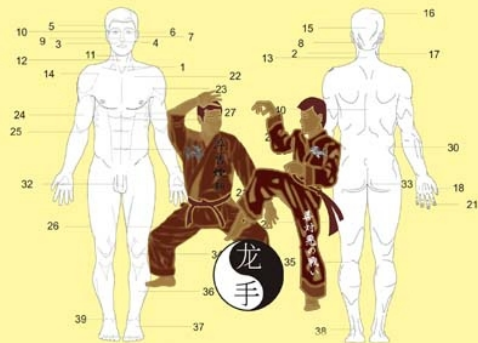
Dim Mak Deadly Nerve Points