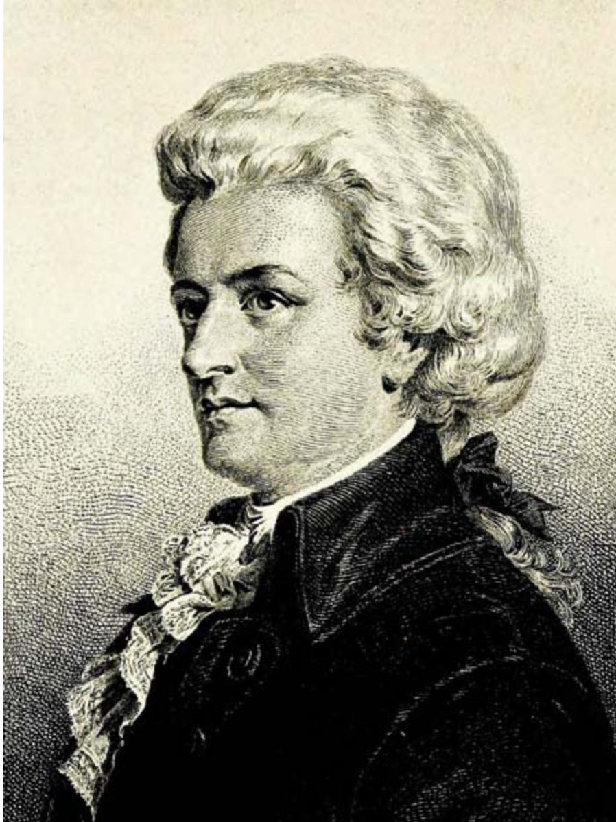
WOLFGANG AMADEUS MOZART.