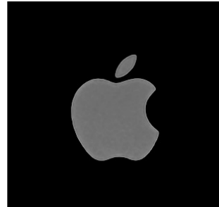
Figure 1-1: This is what you'll see if everything is fine and dandy when you turn on your Mac.

Either way, the Desktop soon materializes before your eyes. If you haven't customized, configured, or tinkered with your Desktop, it should look pretty much like Figure 1-2. Now is a good time to take a moment for positive thoughts about the person who convinced you that you wanted a Mac. That person was right!