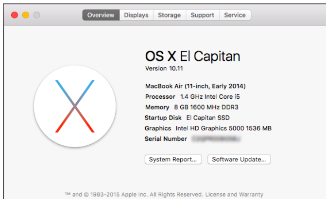
Figure 1-4: See which version of OS X you're running.

A window pops up on your screen, as shown in Figure 1-4. The version you're running appears just below OS X El Capitan near the top of the window. Version 10.11 is the release we know as El Capitan .