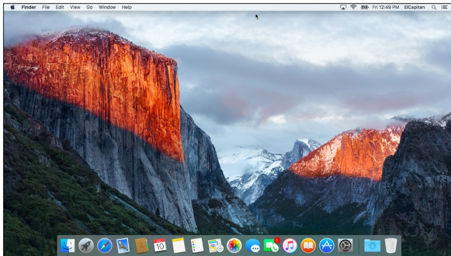
Figure 1-2: The OS X El Capitan Desktop after a brand-spanking-new installation of OS X.

✔ Blue/black/gray screen of death: If any of your hardware fails when it's tested, you may see a blue, black, or gray screen.