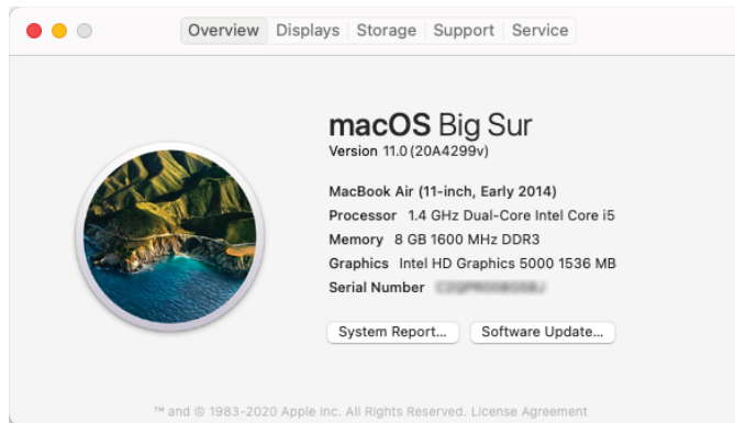
FIGURE 1-4: See which version of macOS you're running.