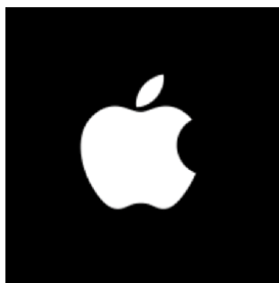
FIGURE 1-1: This is what you'll see if everything is fine and dandy when you turn on your Mac.

When you finally do turn on your Mac, you set in motion a sophisticated and complex series of events that culminates in the loading of macOS and the appearance of the macOS desktop. After a small bit of whirring, buzzing, and flashing (meaning that the OS is loading), macOS first tests all your hardware — slots, ports, disks, random access memory (RAM), and so on. If everything passes, you'll see a tasteful whitish Apple logo in the middle of your screen, as shown in Figure 1-1.