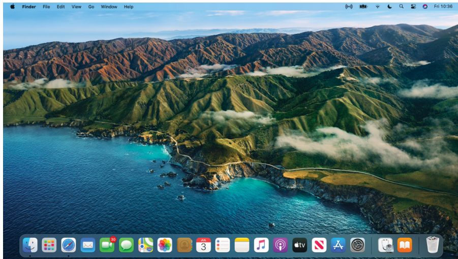
FIGURE 1-2: The desktop after a brand-spanking-new installation of macOS Big Sur.

Either way, the desktop soon materializes before your eyes. If you haven't customized, configured, or tinkered with your desktop, it should look pretty much like Figure 1-2. Now is a good time to take a moment for positive thoughts about the person who convinced you that you wanted a Mac. That person was right!