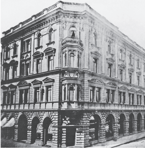
Figure 3 The “Börsenbazar” Maffeistraße 1, the first business headquarters of Munich Re (1880–1913)

had been employed since 1874 at the Rheinisch-Westfälische Rückversicherung in his hometown of Mönchengladbach. His skills were in such high demand that he was offered the position of managing the Badische Rück- und Mitversicherung in Mannheim, where he was the general director for four years. 49 MR's first office space consisted of two rooms in the building at Maffeistraße 1, a building originally known in the city by the name of “Birnbäum-Bräu.” Along Maffeistraße, which had been extended shortly before this, there were prestigious new office buildings housing the central offices of the Bayerische Vereinsbank and the Bayerische Handelsbank. The block containing “Birnbäum-Bräu” and the buildings at Theatinerstraße 3 and Maffeistraße 1 and 3 came to be known as the “Börsenbazar,” or “stock exchange bazaar.” 50