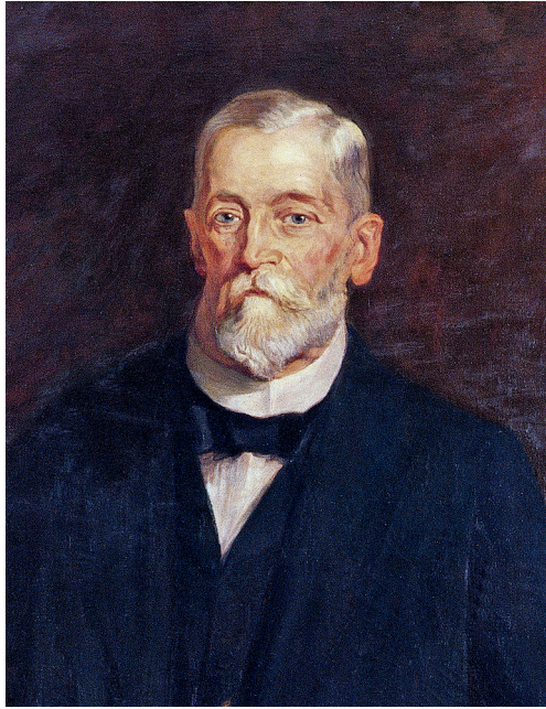
Figure 4 Wilhelm Finck (von Finck from 1905), cofounder of Munich Re and chairman of the supervisory board from 1880 to 1924

and Allianz later worked together did not come into being through a master plan but rather as the result of a longer term, and at first very open, decision-making process and as a carefully balanced compromise among the various interests of the Allianz founders.