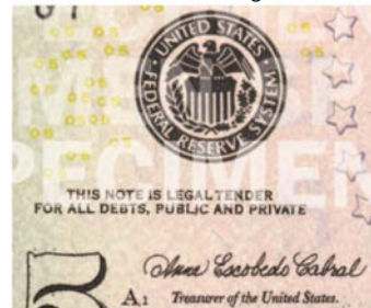
Fig. 2.1 Banknotes now and then.

Signature of the treasurer on the US dollar. Banknotes are “legal tender”.