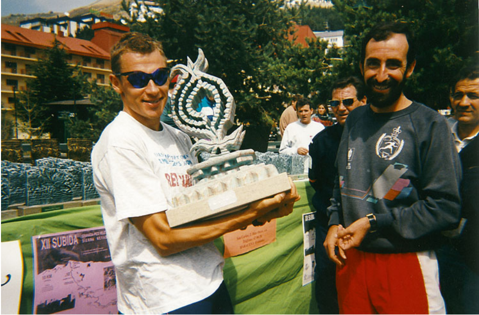
Author (left) holding the Subida Veleta 50 kilometer trophy