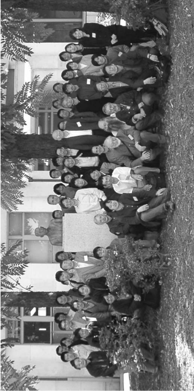
YITP International Symposium on Geometrical Structures of Phase Space in Multidimensional Chaos—Applications to Chemical Reaction Dynamics in Complex System, October 26–November 1, 2003, at the Yukawa Institute for Theoretical Physics, Kyoto University, Kyoto, Japan.