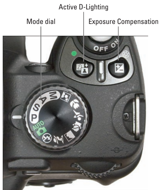
Figure 1-7: The tiny pictures on the Mode dial represent special automatic shooting modes.