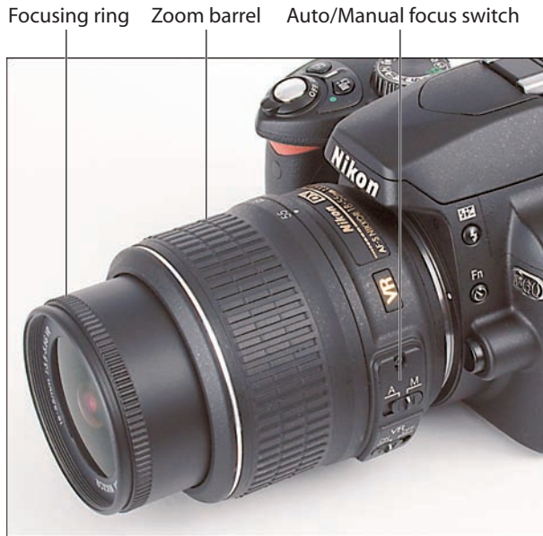
Figure 1-3: Set the focusing mode switch to M before turning the manual focus ring.