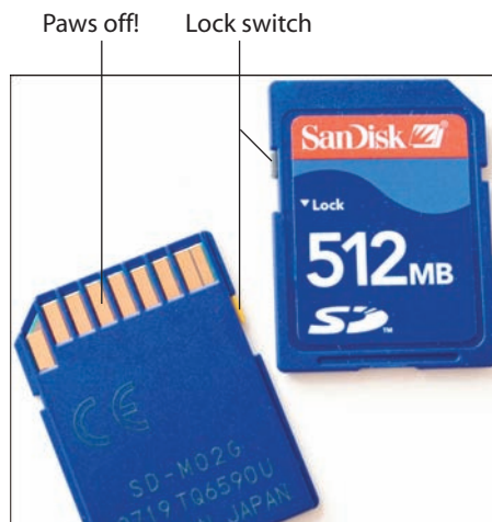
Figure 1-6: Avoid touching the gold contacts on the card.

You can protect individual images from accidental erasure by using the camera's Protect feature, covered in Chapter 4.