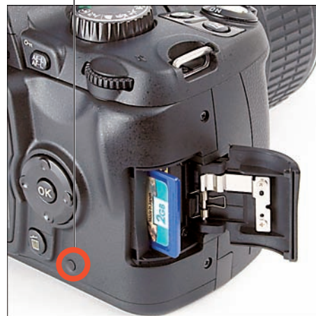
Figure 1-5: Insert the card with the label facing the camera back.