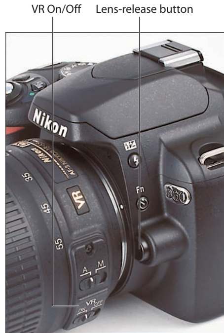
Figure 1-2: Press the lens-release button to disengage the lens from the mount.

If you aren't putting another lens on the camera, cover the lens mount with the protective cap that came with your camera, too.