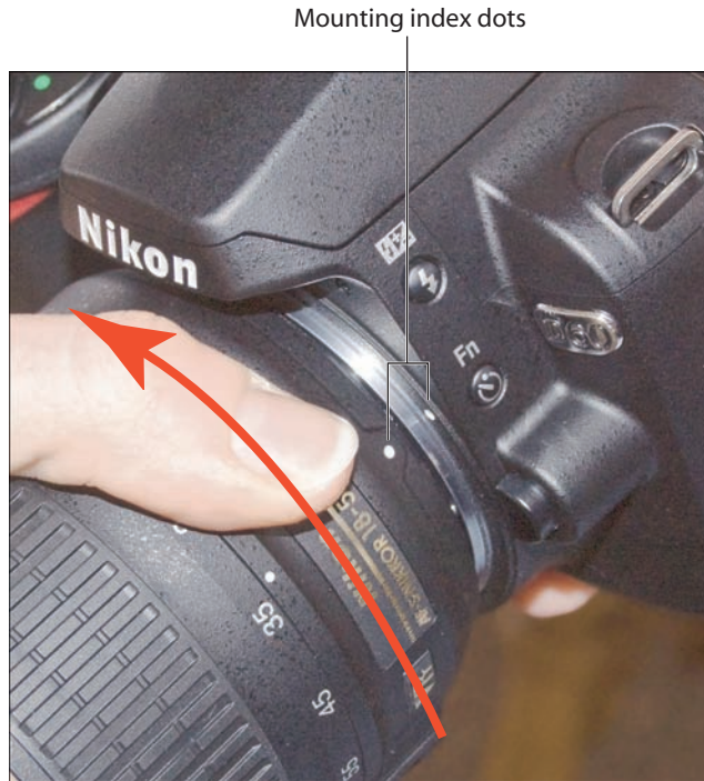
Figure 1-1: When attaching the lens, align the index markers as shown here.