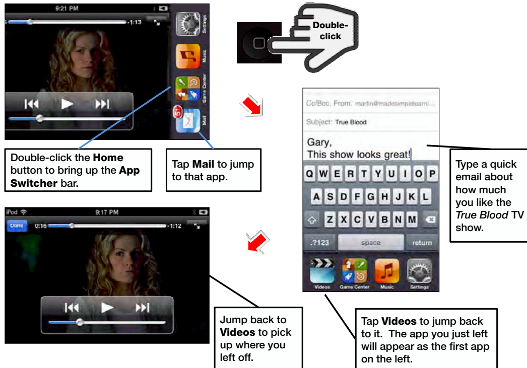
Figure 2. Multitasking (app switching) by double-clicking the Home button

Double-click the Home button to bring up the App Switcher bar at the bottom of the screen. Next, swipe right to see more icons and tap the icon of any app you want to start. If you don't see the icon you want, then click the Home button to see the entire Home screen. Repeat these steps to jump back to the app you just left. The nice thing is that the app you just left is always shown as the first app on the App Switcher bar.