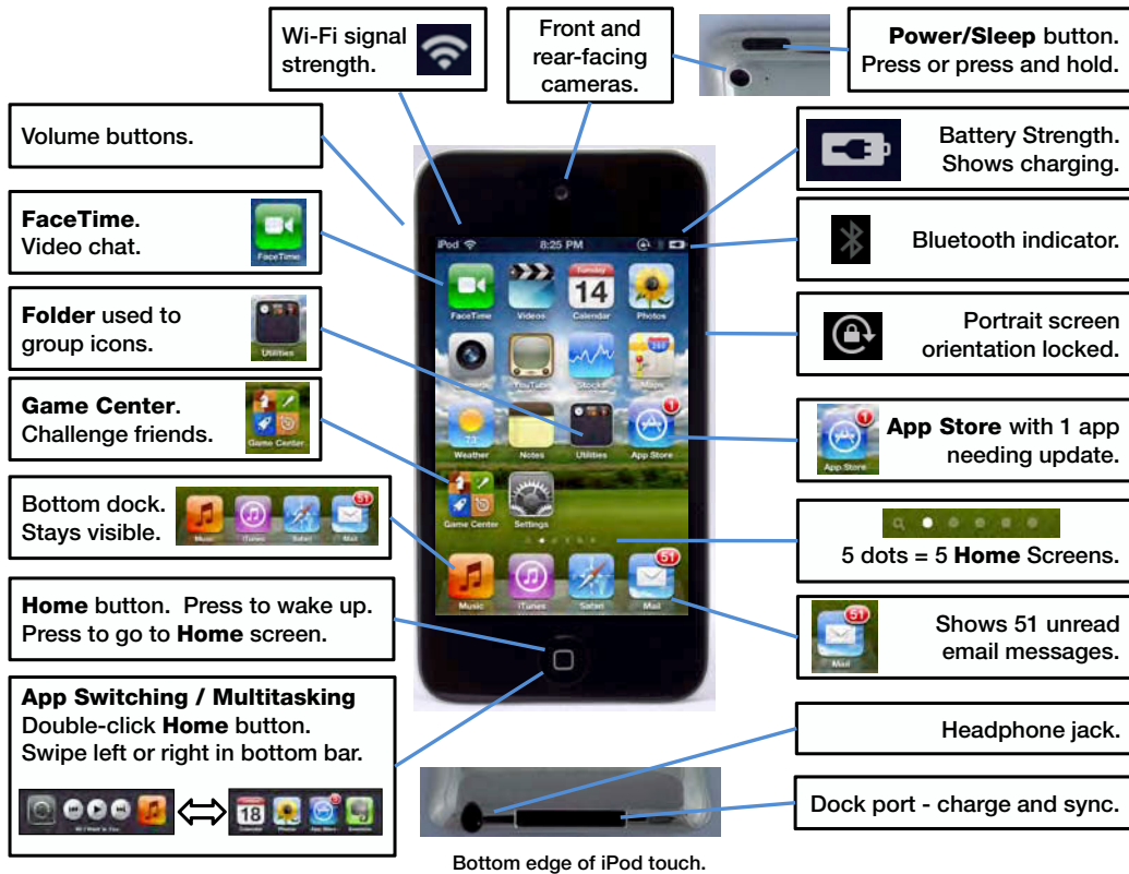
Figure 1. The iPod touch's buttons, ports, switches, and keys

Figure 1 shows all the things you can do with the buttons, keys, switches, and ports on your iPod touch. Go ahead and try out a few things to see what happens. Swipe left to search, swipe right to see more icons, try double-clicking the Home button to bring up the multitasking App Switcher bar, and press and hold the Power/Sleep key. Have some fun getting acquainted with your device.