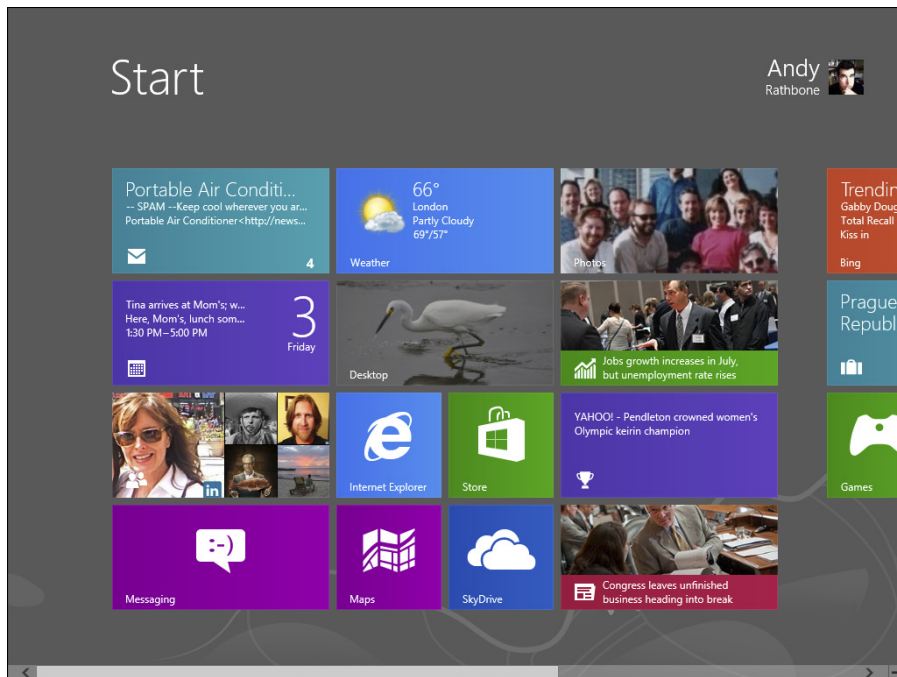
Figure 1-1: The newest version of Windows, Windows 8, comes pre-installed on most new PCs today.

The name Windows comes from all the little windows it places on your computer screen. Each window shows information, such as a picture, a program, or a baffling technical reprimand. You can place several windows onscreen simultaneously and jump from window to window, visiting different programs. Or, you can enlarge one window to fill the entire screen.