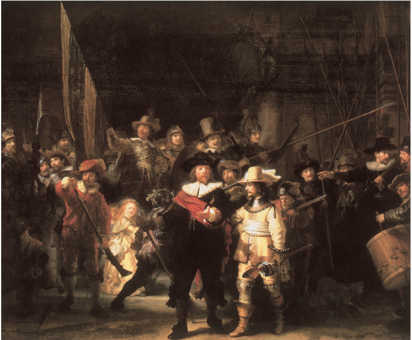
3. The Company of Frans Banning Cocq and Willem Van Ruytenburch also known as The Night Watch , 1642. Oil on canvas, 363 x 437 cm. Rijksmuseum, Amsterdam.

He was only 22 years old when he took his first pupil into his studio. He had not yet mastered all the skills he needed from his teachers and his “imitations” of Lastman lacked assurance, but even if he was still “timid” in comparison with his later work, he never relented to convention.