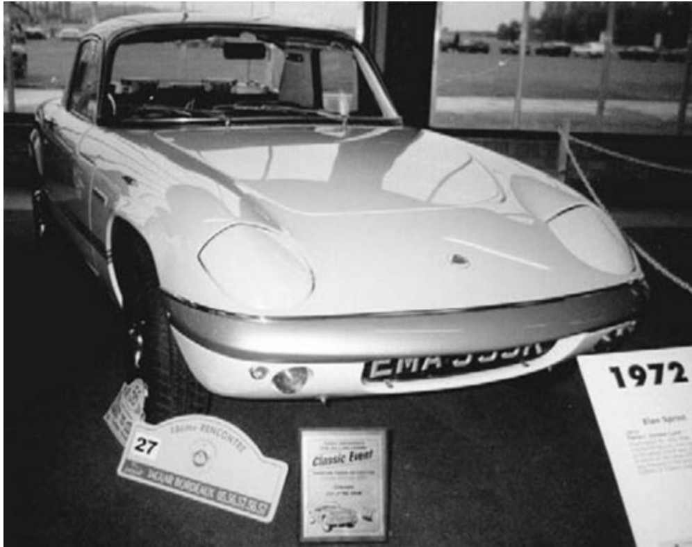
My Elan Sprint (Custard) on show in the main arena building at the Lotus Enthusiasts Car Show, Newark. Rally plaques and recently won concours trophy for the Best Car in Show at Houghton Tower Classic Car Show, 2000

All I can do then is to emphasise that my book is a personal account of my own experiences and that the following words still apply to this day.