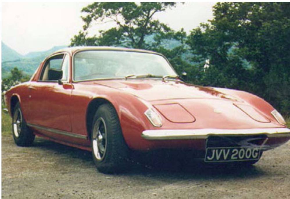
My Elan +2 (Rhubarb) just after its final restoration. The setting, Ullswater in the Lake District. 1992

This book is intended for those people who like the look of a Lotus Elan and would love to own one. It contains information they will need before buying one and subsequent guidance for the inevitable restoration. It is written in an easily readable style, conveying the authors considerable experience in restoring a 1968 Regency Red Lotus Elan +2 more times than I care to remember and a Concours winning 1972 Yellow over White Elan Sprint. More of this car later which, since the publication of the first edition of the book, has had quite an eventful life.