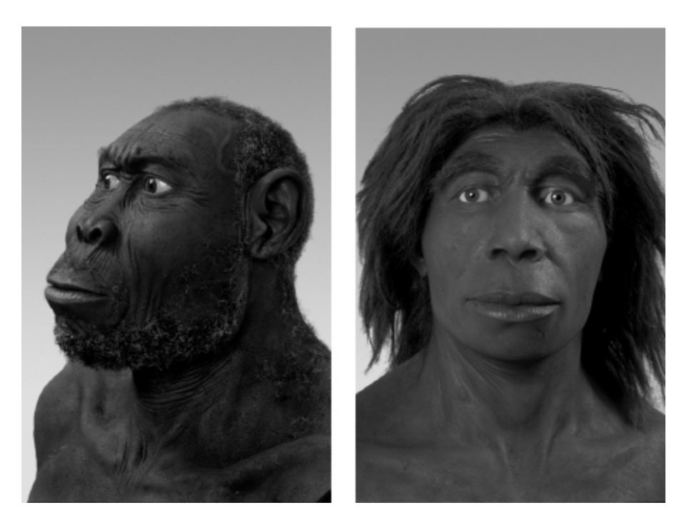
2. Our siblings, according to speculative reconstructions (top to bottom right): Homo rudolfensis (East Africa); Homo erectus (East Asia); and Homo neanderthalensis (Europe and western Asia). All are humans.

Humans first evolved in East Africa about 2.5 million years ago from an earlier genus of apes called Australopithecus , which means 'Southern Ape'. About 2 million years ago, some of these archaic men and women left their homeland to journey through and settle vast areas of North Africa, Europe and Asia. Since survival in the snowy forests of northern Europe required different traits than those needed to stay alive in Indonesia's steaming jungles, human populations evolved in different directions. The result was several distinct species, to each of which scientists have assigned a pompous Latin name.