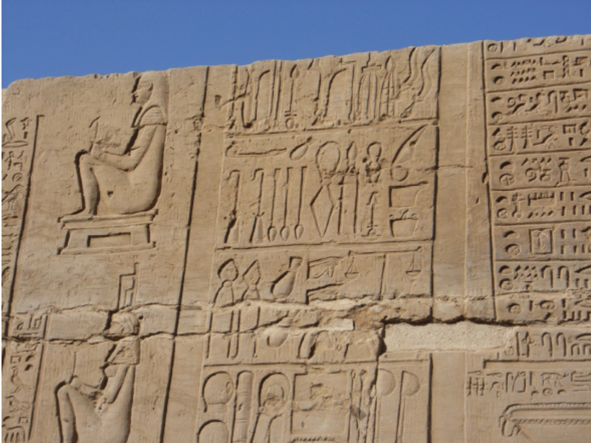
Figure 1.1 Kom Ombo wall, north of Aswan, showing 2000-year-old surgical instruments. Taken by the author in February 2012.

In the British Isles, those who would eventually become the dentists we know today were once part of the Guild of Barber-Surgeons, created in 1540. Most of those who engaged in 'dentistry' in the 16th century identified themselves with the barber surgeons rather than the physicians; that is why dentists in the UK have historically referred to themselves as 'Mister' or 'Miss' rather than as 'Doctor'. Dentistry did not generally take the same path outside of Britain. The Guild broke apart in 1745, when the Surgeons' Company was formed; that company later dissolved in 1796 and then reformed as the Royal College of Surgeons of England in 1800. The barbers, dentists and 'operators for the teeth' took a different path, although a