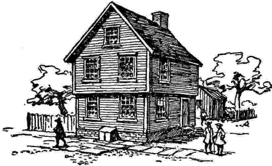
Birthplace of Franklin. Milk Street, Boston.