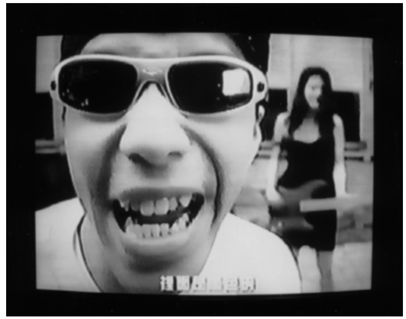
Photo 1.2 Do you speak MTV? Globalized media and popular culture like MTV Asia challenge traditional values in every corner of the world, including China

Human communication is just as necessary today as it was hundreds of centuries ago, but social exchange and the cultural domains that human interactions help create assume radically different forms and formats in the era of globalization. As British sociologist David Chaney points out, "traditionally, social institutions such as family and religion have been seen as the primary media of [cultural] continuity. More recently ... the role of ensuring continuity has increasingly been taken over by ... forms of communication and entertainment" (Chaney 1994: 58).