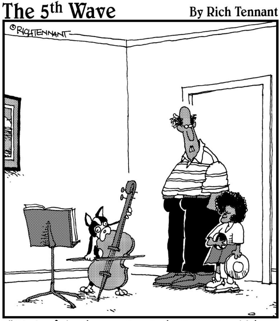
"To be fair, the people at the Kennel said he liked to play, not that he was playful."