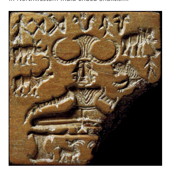
Fig. 1: This seal from the Indus valley shows yoga poses (seated poses), here the "Muhlabandhasana".

During the early Indus culture, people revered the female energy (Shakti force) as the Mother of all Life, placed the feminine principle above the male. The invasion of Indo-Aryans beginning around 1500 BCE, in Northwestern India ended Shaktism.