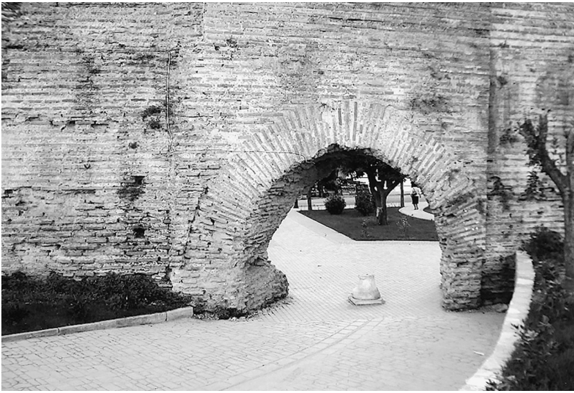
Fig. 2 Part of the walls at Dyrrachium (Dures, Albania), birthplace of the Emperor Anastasius (AD 491–518)

and the Euphrates was a military road, not a fortified line. The ‘frontiers’ of the early Byzantine period were very different from the closed and policed borders of modern states, and in later periods of Byzantine history the notion of a frontier was even more fluid; there was also a high degree of regional variation. We should think rather in terms of broad frontier zones that were zones of contact rather than of exclusion: there was no standing army stationed along fixed boundaries. This permeability was at its most pronounced in Anatolia and the east where for several centuries Christian and Muslim populations were fought over and intermingled; these borderlands form the background, however distant, to the romance of Digenes Akrites, whose father was an Arab emir and whose mother was the daughter of a Byzantine strategos in Cappadocia. 25