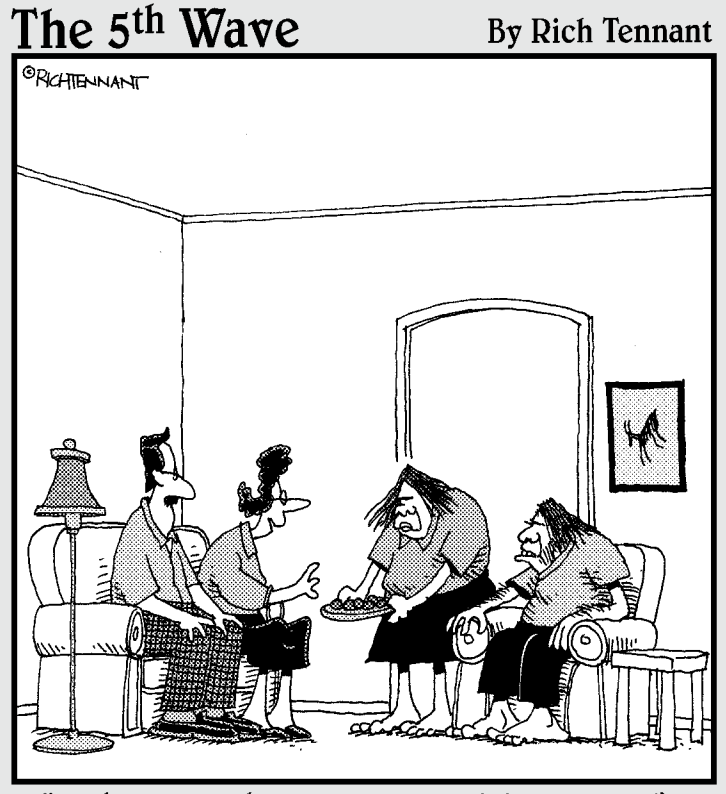
"So how long have you been living Paleo?"