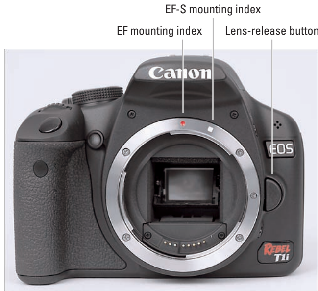
Figure 1-1: Which index marker you should use depends on the lens type.

The lens also has a mounting index; Figure 1-2 shows the one that appears on the so-called “kit lens” — the EF-S 18–55mm IS (image stabilizer) zoom lens that Canon sells as a unit with the Rebel T1i/500D. If you buy a different lens, the index marker may be red or some other color, so again, check the lens instruction manual.