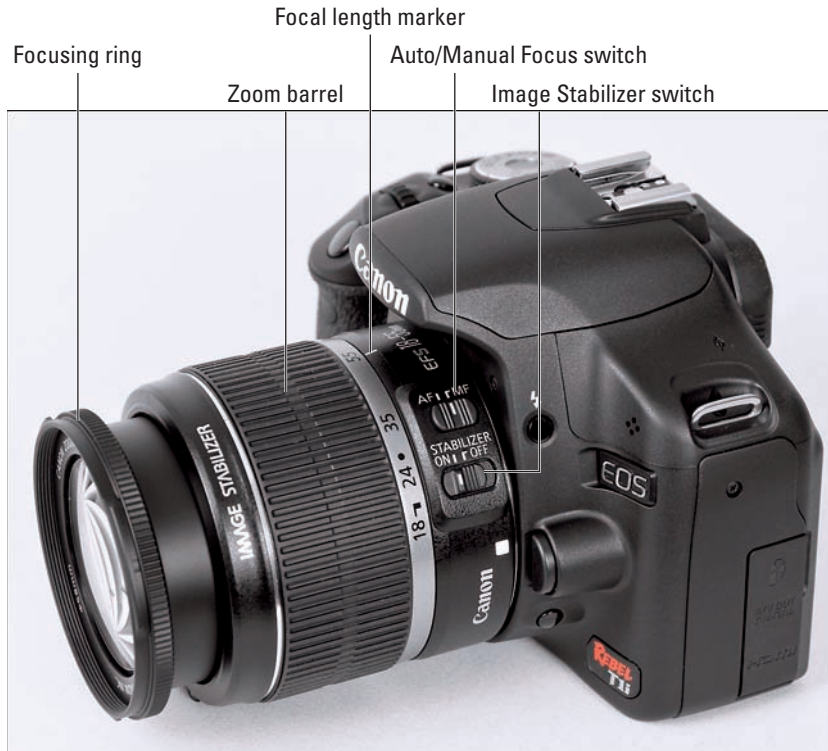
Figure 1-3: Set the focusing switch to MF before turning the manual focus ring.

However, when you use a tripod, image stabilization can have detrimental effects because the system may try to adjust for movement that isn't actually occurring. Although this problem shouldn't be an issue with most Canon IS lenses, if you do see blurry images while using a tripod, try setting the Stabilizer switch (shown in Figure 1-3) to Off. You also can save battery power by turning off image stabilization when you use a tripod.