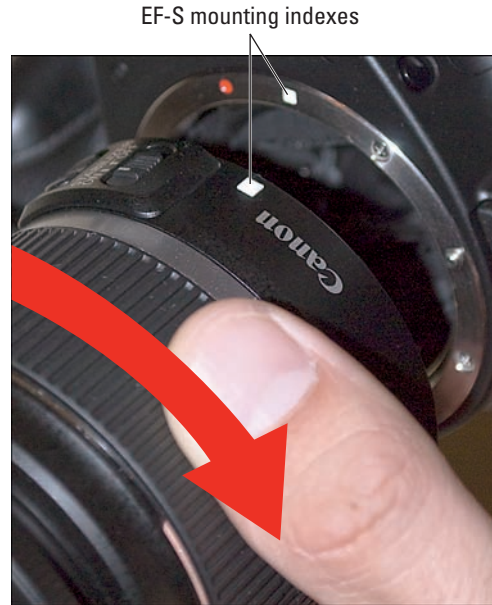
Figure 1-2: Place the lens in the lens mount with the mounting indexes aligned.

Always attach (or switch) lenses in a clean environment to reduce the risk of getting dust, dirt, and other contaminants inside the camera or lens. Changing lenses on a sandy beach, for example, isn't a good idea. For added safety, point the camera body slightly down when performing this maneuver, as shown in the figure. Doing so helps prevent any flotsam in the air from being drawn into the camera by gravity.