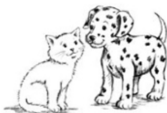
Sparkle and Belle